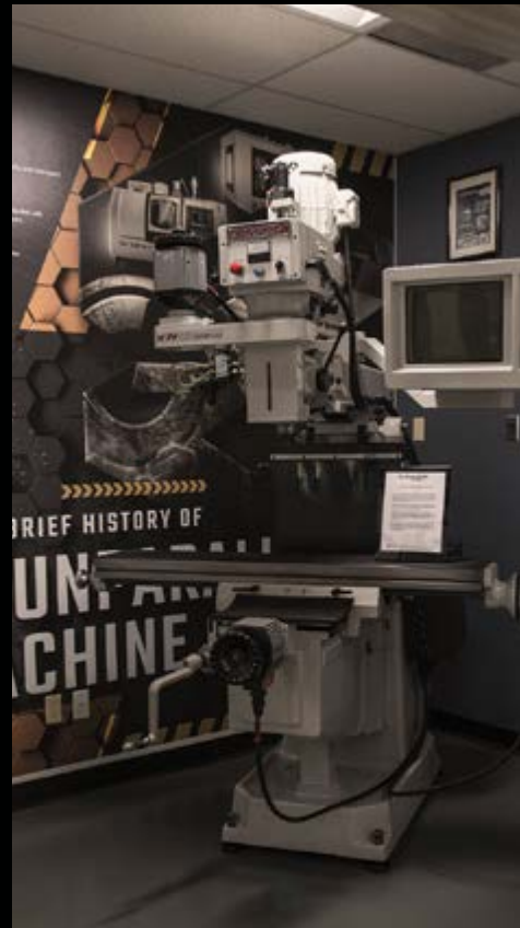
COMPANY HISTORY ROOM