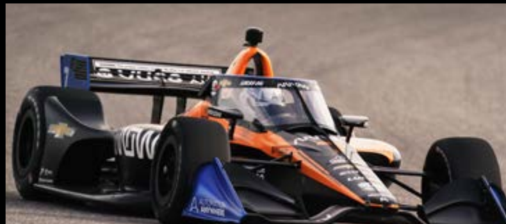
RACING SPONSORSHIPS WITH ARROW MCLAREN SP RACE TEAM

It began with a dream in 1985 to deliver superior quality machine tools to the market that provided the highest value and productivity available. We are still driven by this same commitment to you.