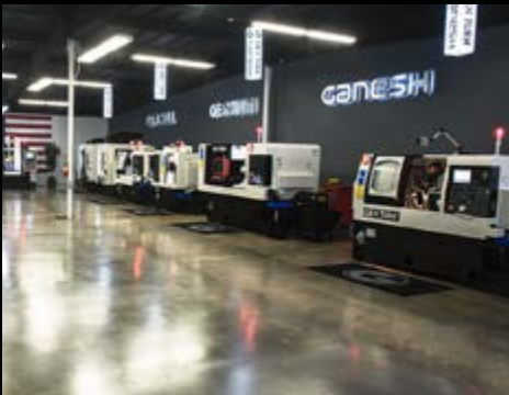
FEATURING A LARGE 4,000 SQ. FT. SHOWROOM