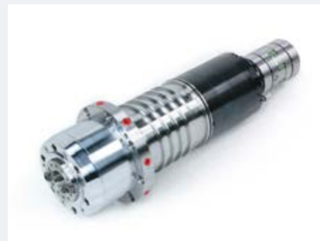
12,000RMP Direct Drive Spindle