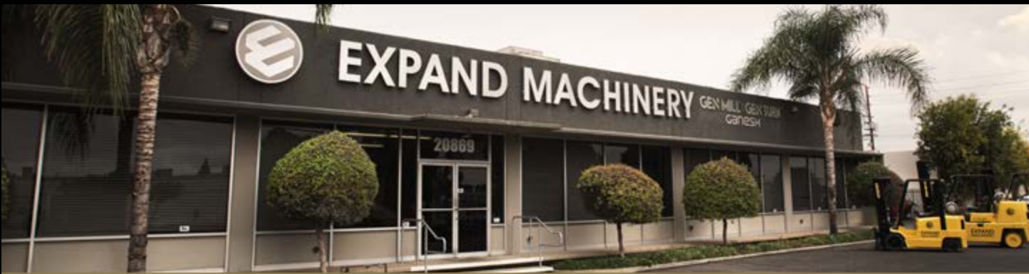
HEADQUARTERS LOCATED IN CHATSWORTH, CA