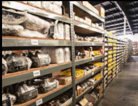
FULLY STOCKED PARTS ROOM